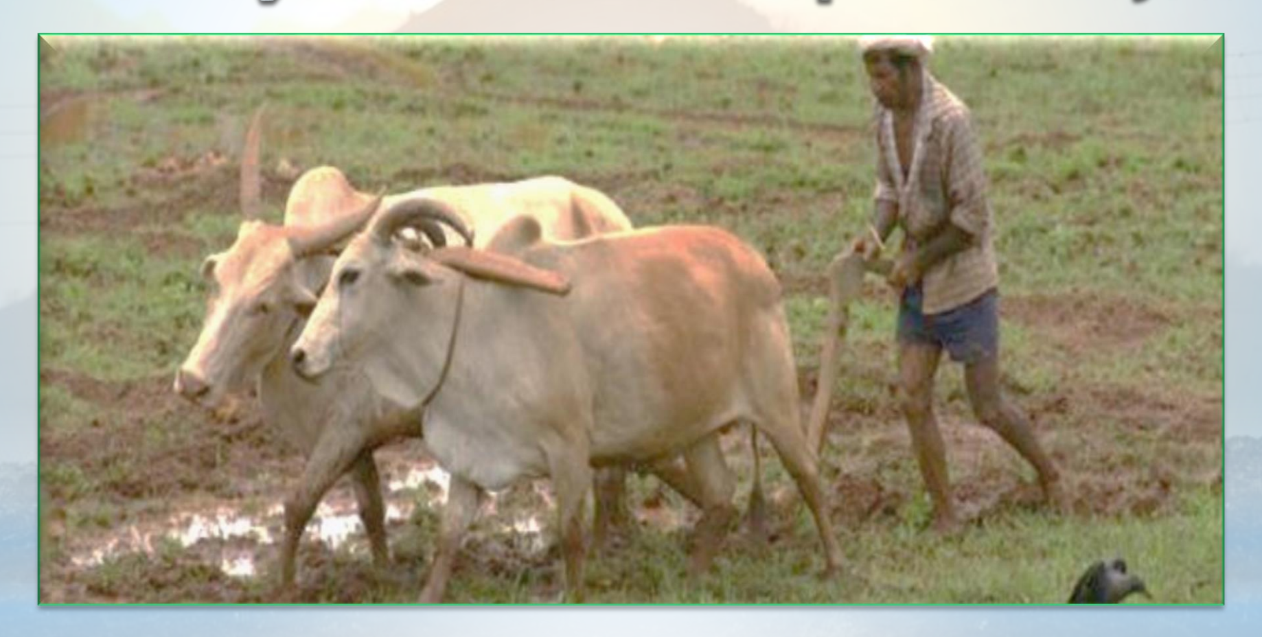
Run By: Deendayal Bahuuddeshiya Prasark Mandal, Yavatmal