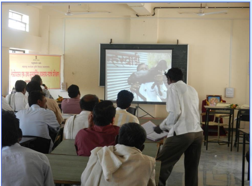
Training Program, Wani